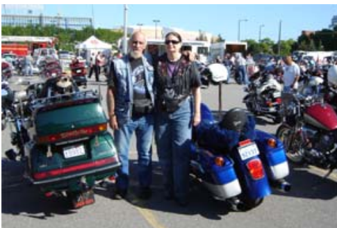
50 : 50 Winners of $320