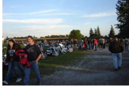
Bikes kept arriving all evening and filled the area