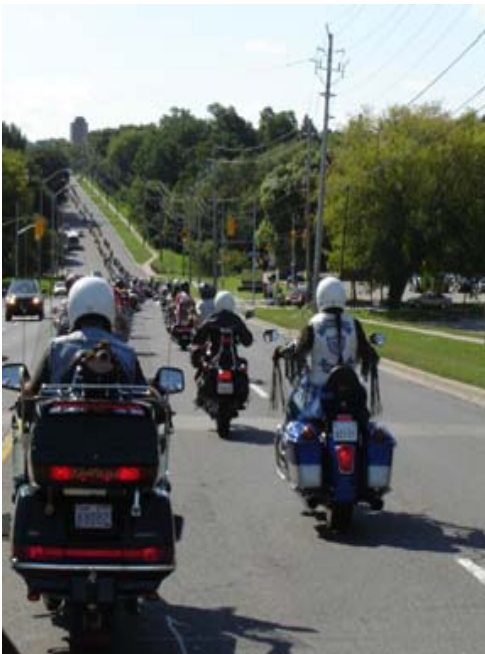
Stagger formation during the ride