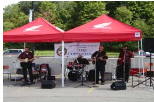
The band "The Coppertones" were great