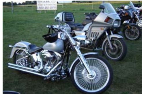
Lots of Bikes "showing their wares"